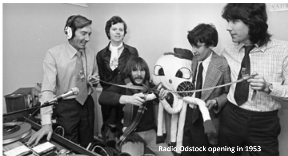
Radio Odstock opening in 1953