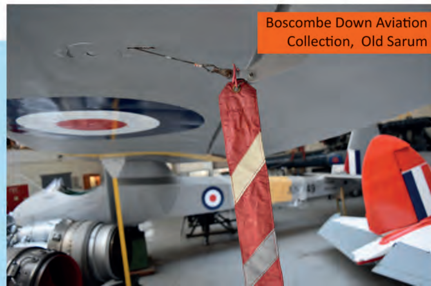
Boscombe Down Aviation Collection, Old Sarum

Many of these offer discounts or family/group tickets: Hawk Conservancy, Finkley Down Farm, New Forest Wildlife park, Marwell Zoo, Longleat.