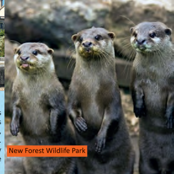
New Forest Wildlife Park